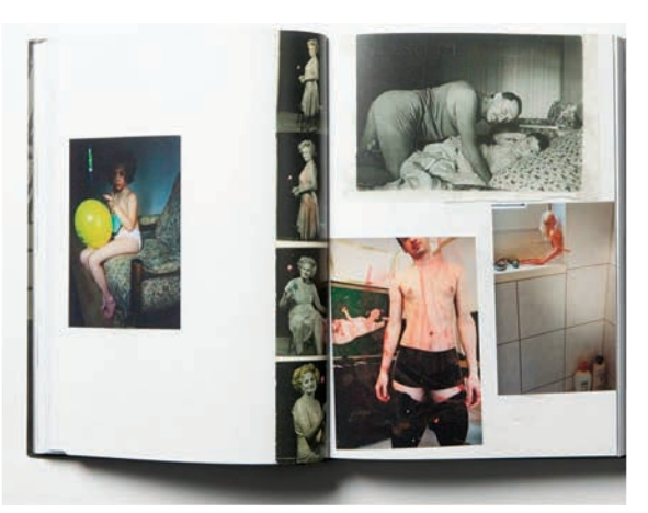
Fig. 6. Boris Mikhailov "Diary", 2015