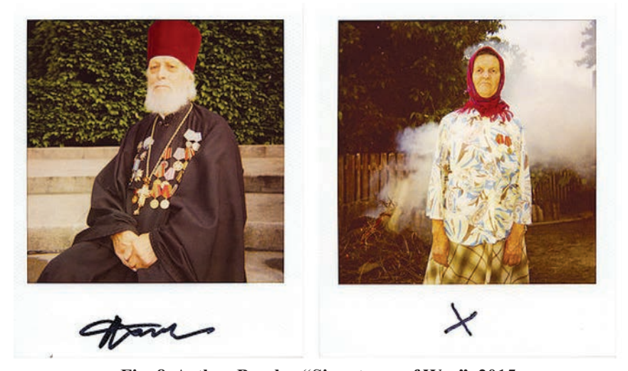
Fig. 8. Arthur Bondar "Signatures of War", 2015