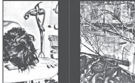
Fig. 5. Viacheslav Poliakov, "Backspaces", 2016

(source: https://via-poliakov.com/backspaces.html)