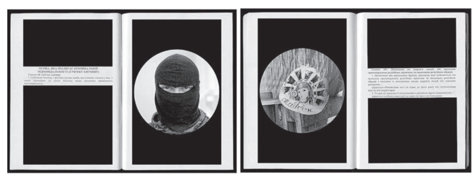
Fig. 7. Arthur Bondar "Barricade", 2015