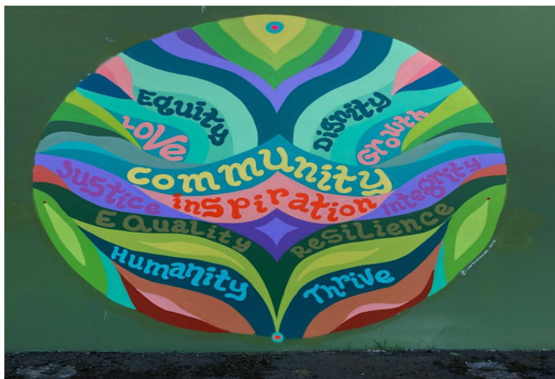
Fig. 2. "WestSide Baby's Community"

Thus, at the first stage of learning, it is possible to achieve understanding on the part of the students that goes beyond their linguistic competence. This understanding is the basis for further verbalizing content assumptions using the target language at the second stage. In this way, these works offer great potential by providing learners with opportunities for multiple verbal actions through immediate visual stimulus. The works can be not only just described but also thought over and and discussed. The method of dealing with a sample of street art depends on the learning task and students' level of language proficiency. We can find a lot of samples which can be used when applying interdisciplinary and cultural approaches when learning different topics. Strong social and sociocultural ideas of the works, which can be both locally and globally influential, are suitable not only for the development