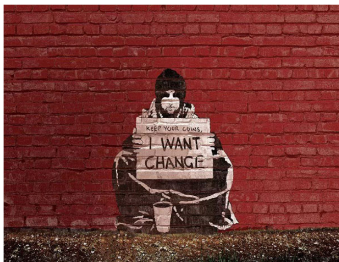
Fig. 3. The Homeless Bill of Rights

After discussions and interpretations, the insights gained are used to create students' own products in their further linguistic activities. Students reproduce the results of the first two steps and develop them further by presenting their ideas, discussing them, presenting them in the form of texts, etc. Students express their linguistic reactions. Students react to the work with their linguistic action, but form their own discursive space beyond the concept of the work. This means that the artist's ideas serve as impulses for starting students' speech actions and related independent formation of educational and living space. Responding to the artist's ideas with their own assumptions and ideas, students expand the discursive situations they created in the first two stages of the learning activity. They respond to the work in the same way that passers-by might respond, to feel like participants in the discourse of both the learning space and the living space. They can participate in discourses that extend beyond their original discursive space (e.g. in the classroom, in an Internet blog, etc.) and feel how different spaces are arranged and connected with each other. In addition, they create a linguistic product in the language studied, and which is formed under the influence of spatial phenomena and contributes to the development of their linguistic competence.